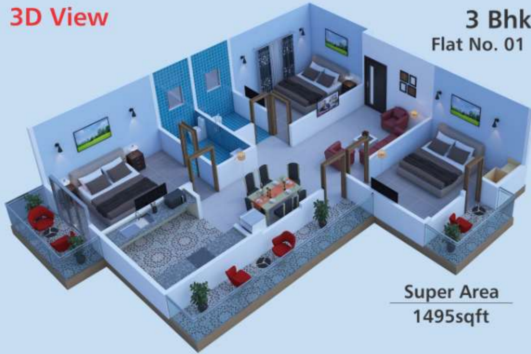
3 Bhk Flat No. 01 | 03