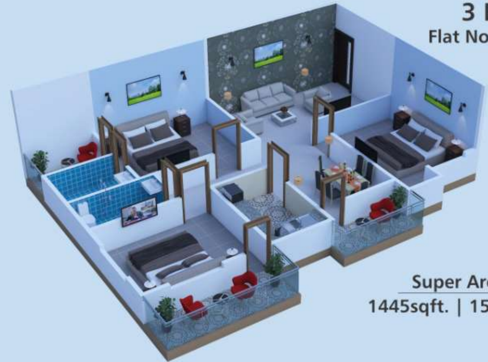
3 Bhk Flat No. 04 | 07