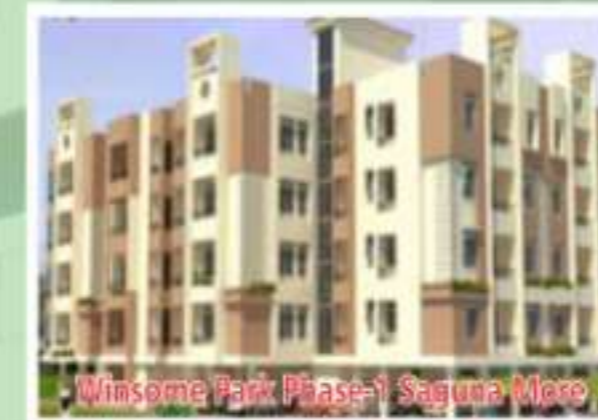
Winsome Park Phase-1 Saguna More