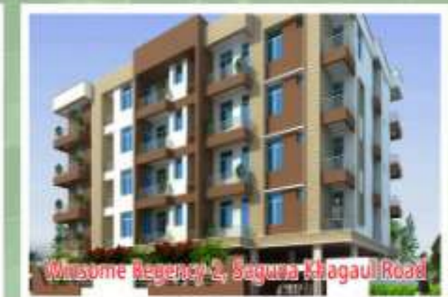
Winsome Regency 2 Saguna Khagaul Road