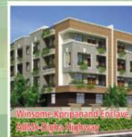
Winsome Kripanand Enclave ANMH-Digha Highway