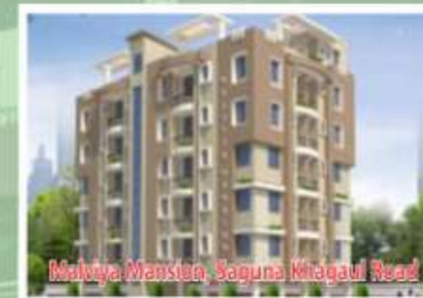
Malviya Mansion Saguna Khagaul Road