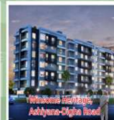
Winsome Heritage Ashyara-Digha Road