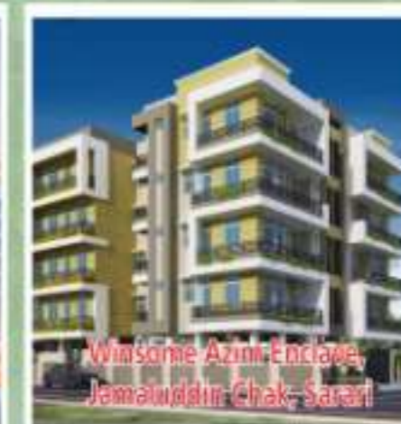
Winsome Azim Enclave Jamauldar Chak Sarani