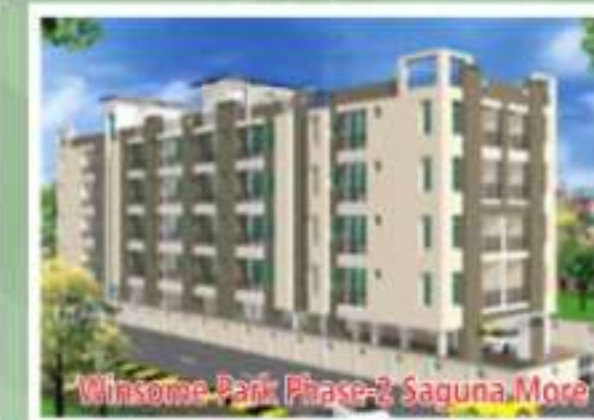
Winsome Park Phase-2 Saguna More