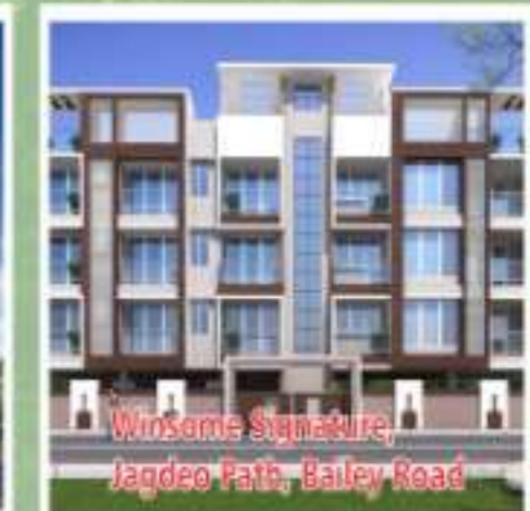
Winsome Signature Jagdeo Path, Bailey Road