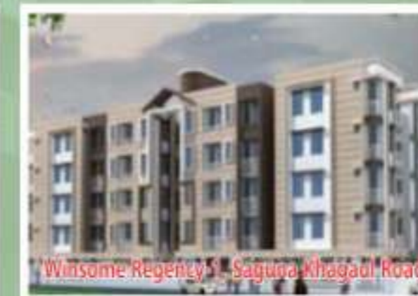
Winsome Regency 1 Saguna Khagaul Road