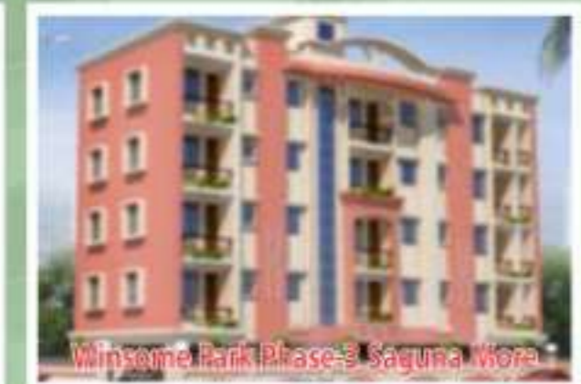
Winsome Park Phase-3 Saguna More