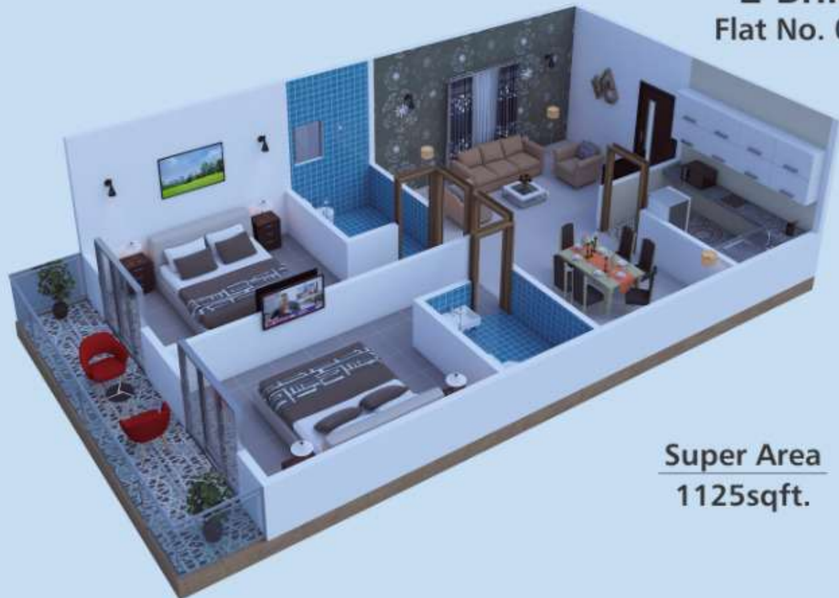
2 Bhk Flat No. 02