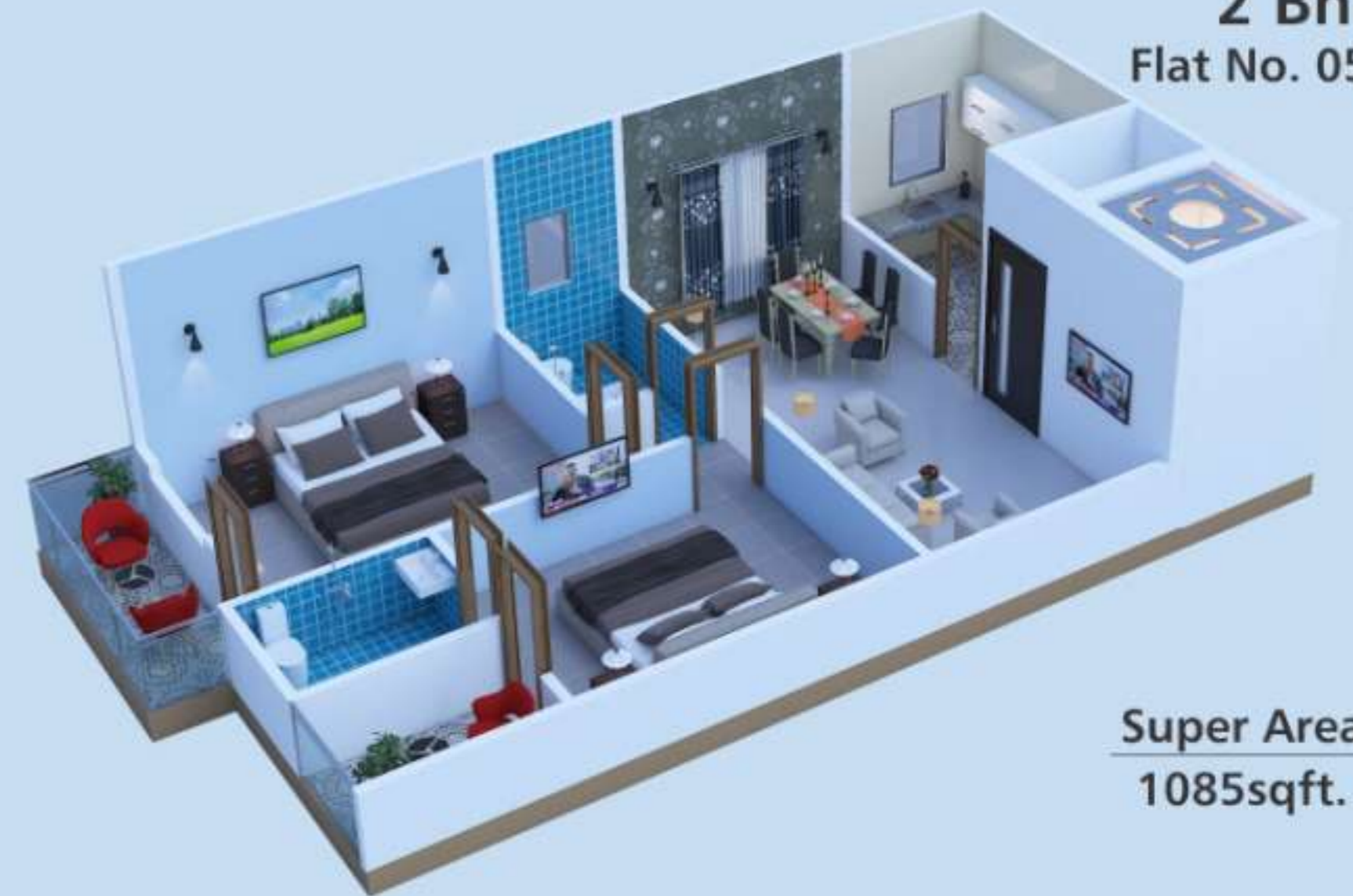
2 Bhk Flat No. 05 | 06