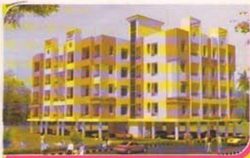
WINSOME PARK PHASE -I