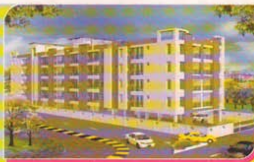
WINSOME PARK PHASE -II