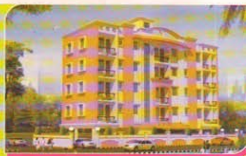
WINSOME PARK PHASE -III